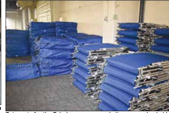
Extra cots for the Fairplex emergency shelter were unloaded in Building 5, stacked up and ready to go as needed.

board has declared a state of emergency "in order to mobilize aid and support for residents and families affected by these fires."