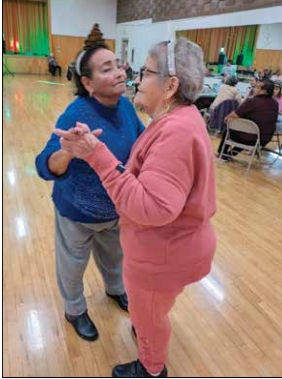
ANNUAL NEW YEAR'S CELEBRATION AT PALOMARES -- It was time once again last month for the annual New Year's celebration for seniors at Pomona's Palomares Park Community Center. The party, actually held as a luncheon event the Friday before New Year's Eve, combined seniors participating in the city's lunch programs at both Palomares and Washington Parks. Everything was included from hats, noisemakers and bubbly beverages to a live disc jockey.