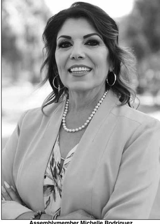
Assemblymember Michelle Rodriguez

"I'm proud our Assembly boasts the greatest number of