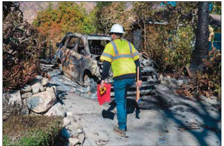
EATON FIRE -- A Los Angeles County Department of Building and Safety employee "red