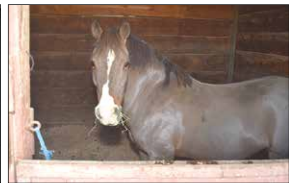
Two horses evacuated from the Southern California wildfires to the stables at Pomona's Fairplex had a suspicious eye on the La Nueva Voz camera as they had their picture taken while getting used to the new and temporary surroundings.